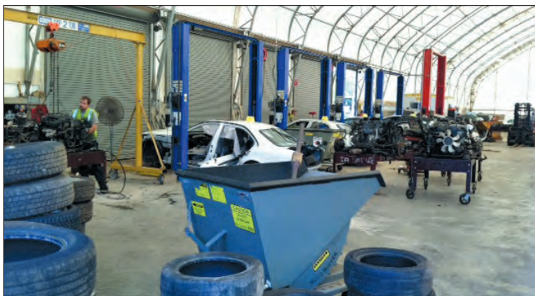
Dismantling of Vehicles