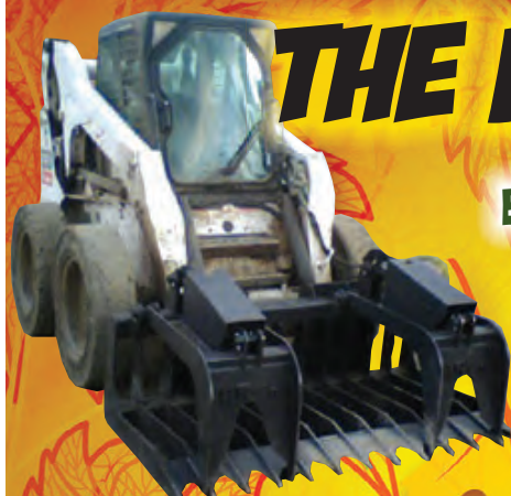
Skid Steer Buckets and Grapples